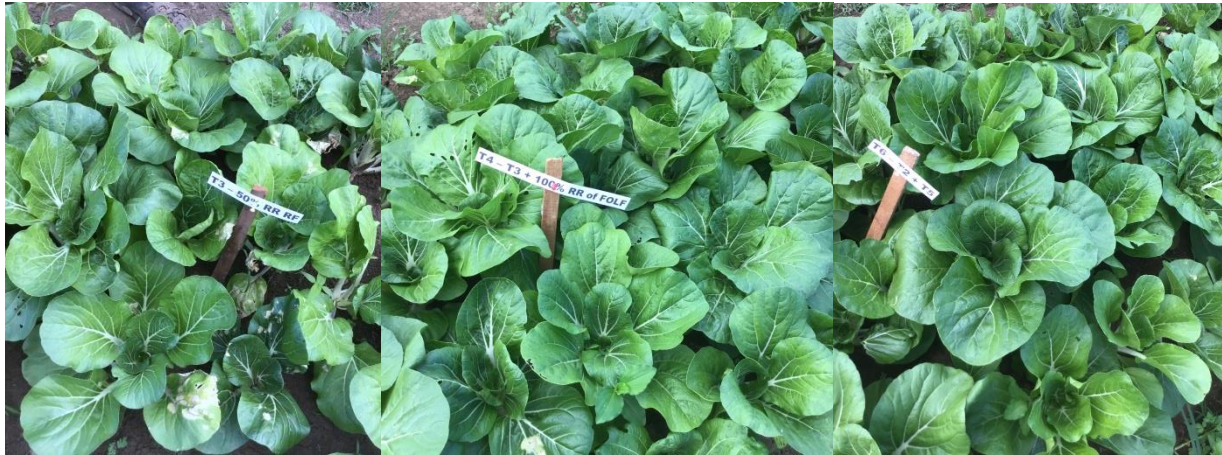
Annex Fig. 3. Stand of pechay plants under T3 (50% RF); T4 (T3+T5) and T6 (T2 and T5)