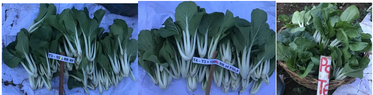
Annex Fig. 4. Marketable pechay plants under T3 (50% RF); T4 (T3+T5) and T6 (T2 and T5)