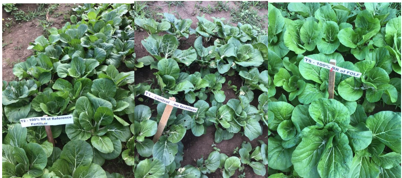
Annex Fig. 2. Stand of pechay plants under T2 (reference fert); T1 (control) and T5 (FOLF)