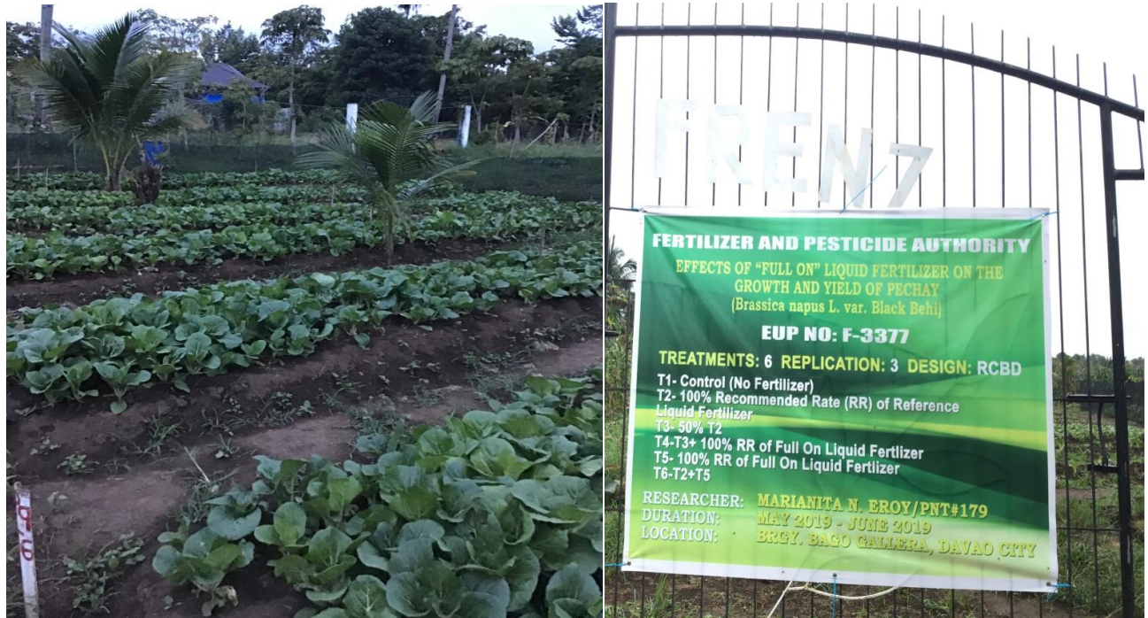
Annex Fig.1. View of the trial site.